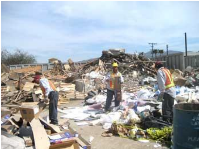
EDCO CDI Recycling Facility – San Marcos

EDCO processes mixed construction loads of drywall, cardboard, lumber, metal, rock and asphalt at the company's CDI processing facilities.