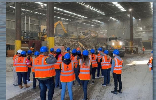
Tour of C&D Processing Facility