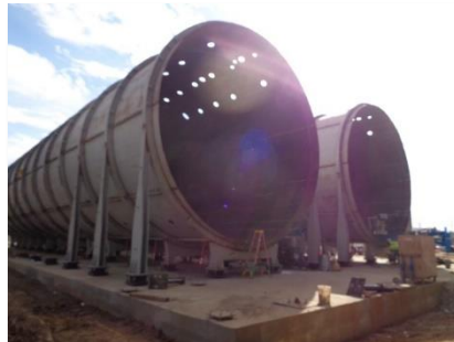
February 21, 2020