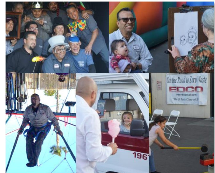
Founders Day Celebration