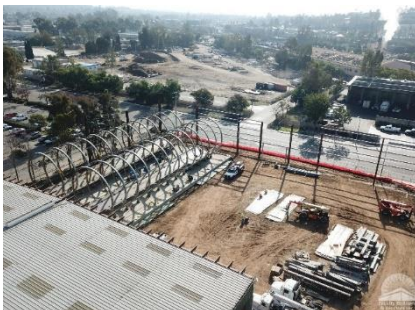
January 13, 2020

The site is filled daily with activity of multiple trades being coordinated by our General Contractor as well as Hitachi, the technology provider, and will be operational in early 2021. Visit edcodisposal.com to watch EDCO's live AD construction.