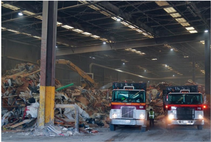
SANCO Resource Recovery (SRR) , Lemon Grove