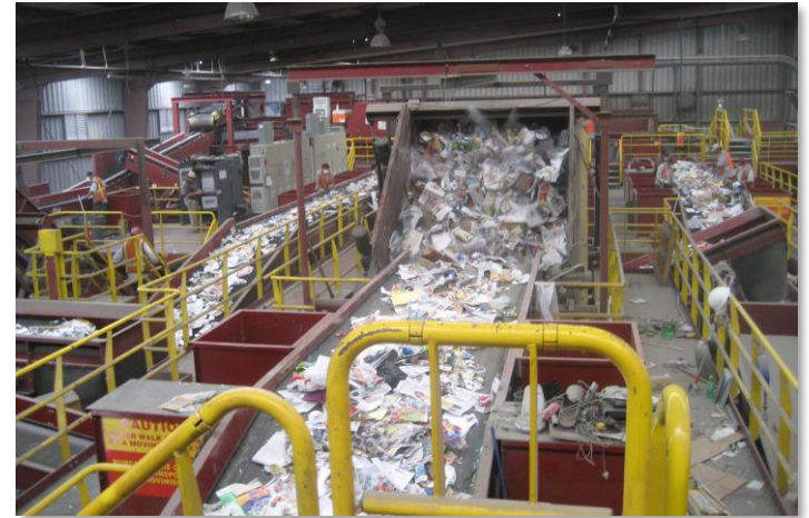
EDCO Recycling, Lemon Grove