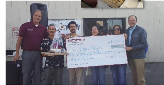
20 and 40 Year Celebrations