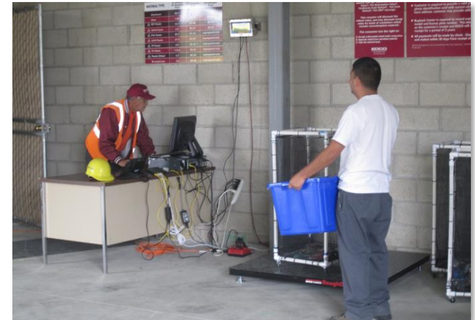
EDCO Recycling and Transfer – Signal Hill