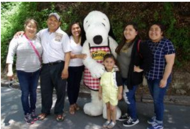
Family Day Event