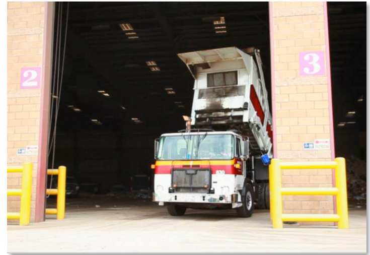
EDCO Recycling and Transfer – Signal Hill

Instead of multiple trucks going to faraway locations, these trucks go to our transfer stations. The waste is offloaded, sorted and combined into larger trucks to be sent to landfills and recycling centers, ultimately reducing the total number of vehicular trips to and from each site.