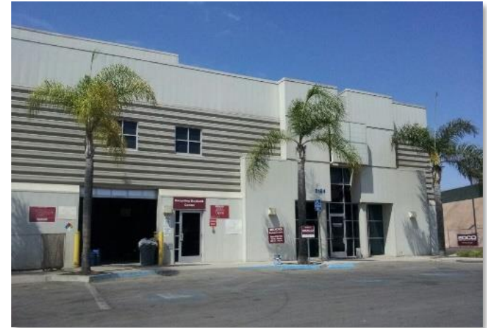
EDCO Station – La Mesa