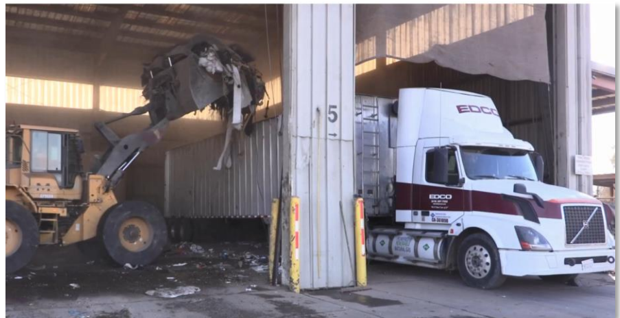
Ramona Transfer Station