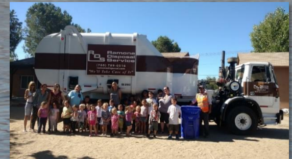
Elementary School Presentation