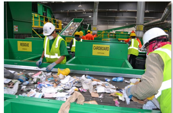
Escondido Resource Recovery